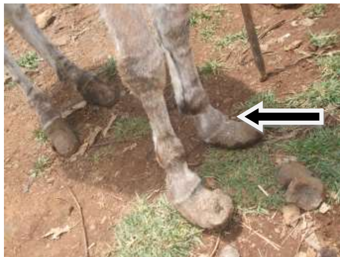
Figure 1. Lameness due to hoof overgrowth on the legs of a donkey.