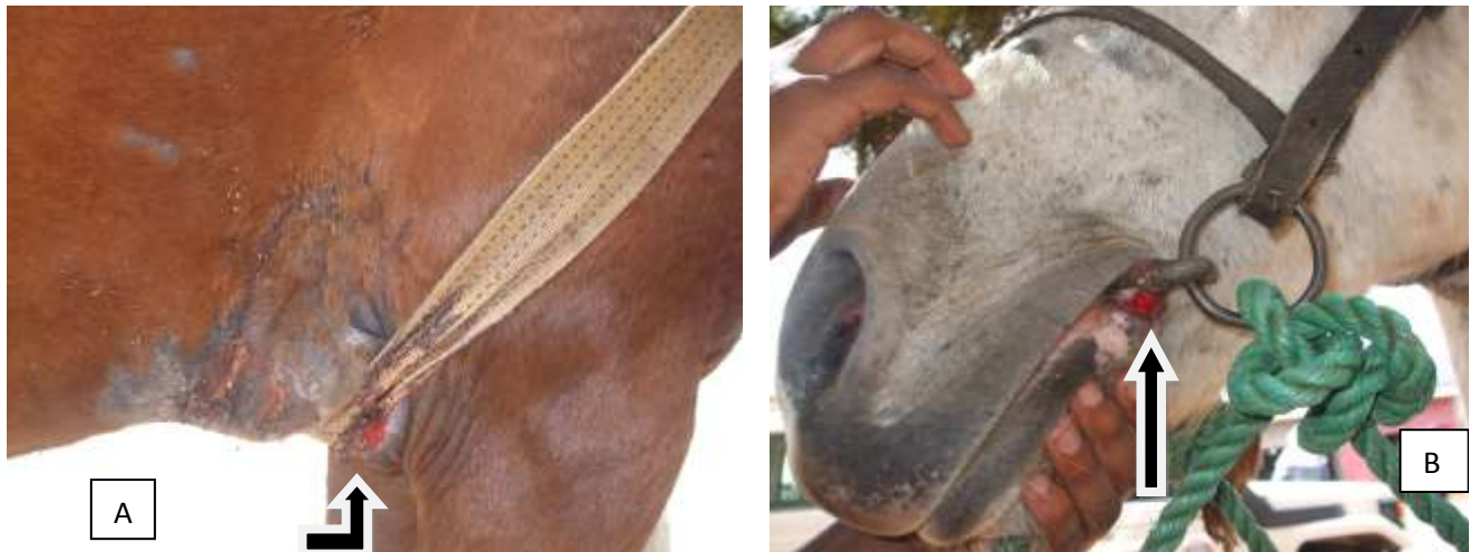
Figure 2. (a) Girth sore due to improper use of harness (b) Lip lesion due to improper and ill-fitted bit.

part of Ethiopia (Ashinde et al., 2017). This may be due to the variation in the type work, frequency of work, harness materials used and the level of awareness of the owner or donkey driver about animal welfare in the two study sites.